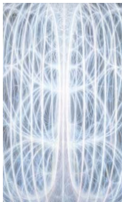
From: Sacred Mirror, by Alex Gray

Energies must be able to flow without hindrance between the poles as a precondition for harmony, order, completeness and health. In Polarity-Therapy we speak of ones "energy anatomy".